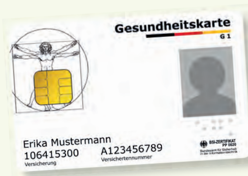
Sample of health care card

Please always bring your electronic healthcare card (elektronische Gesundheitskarte) with you when accessing health services. Since the 1st of January 2015, this card is the only valid proof of entitlement for accessing statutory health care benefits. Your name, date of birth and your address, as well as your health insurance membership number and your insurance status (member, covered family member or pensioner) are the mandatory details saved on the electronic healthcare card. The electronic healthcare card also includes a photograph of you.