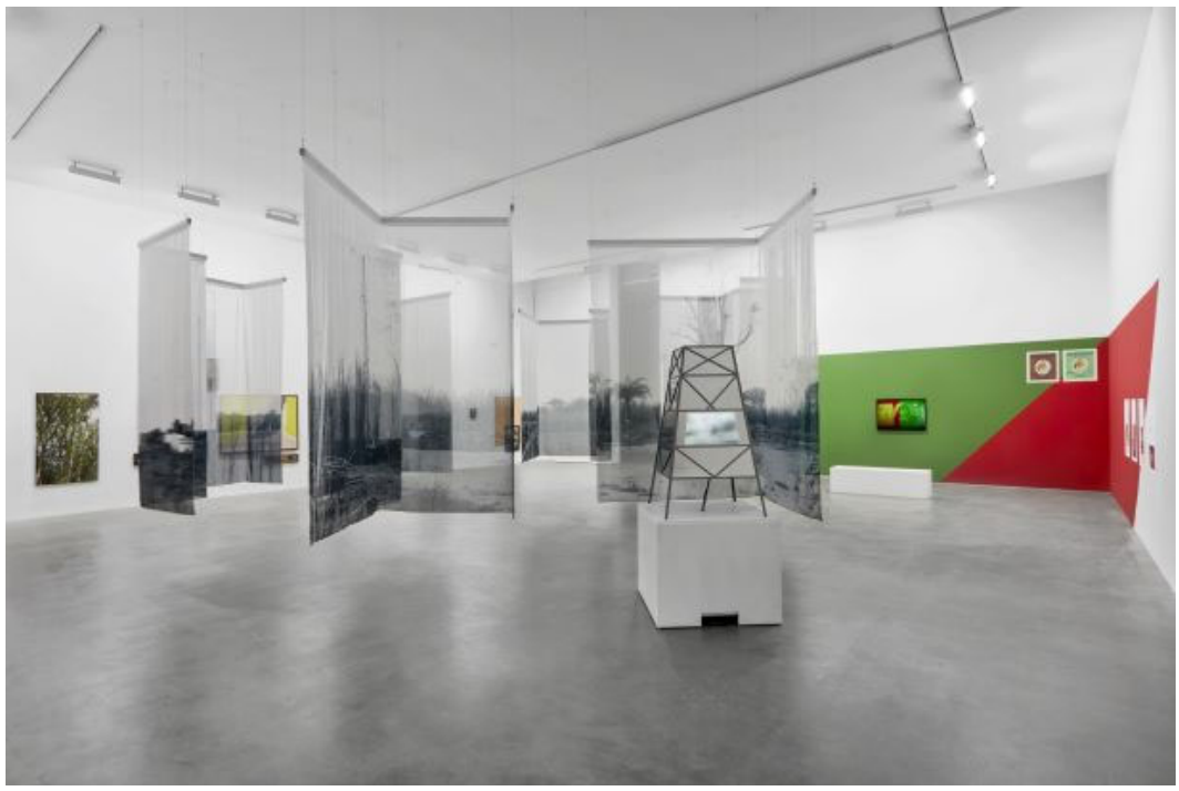
Exhibition of Bianca Baldi's work

Please find the programme of the series online.