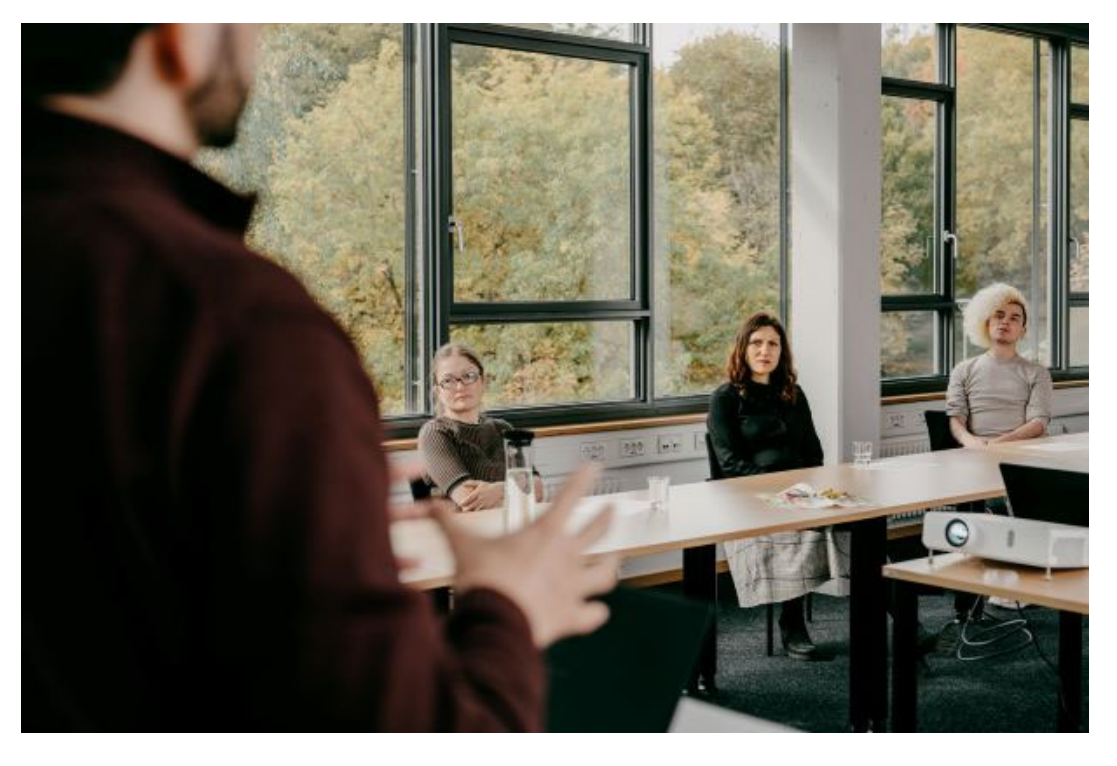
Welcome to the 2021 summer semester